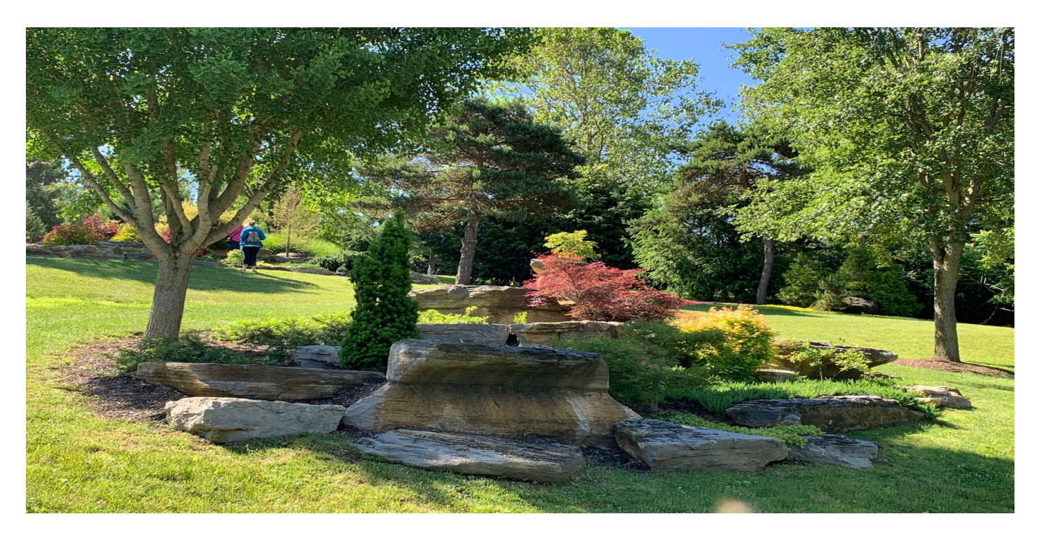
June Meeting Wrap Up The CLA June Member 'Drop-In" Meeting at