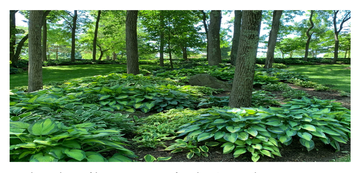
Photos in the issue of the NewScape Express are from The CLA June Member 'Drop-In" Meeting at Schnormeier Gardens