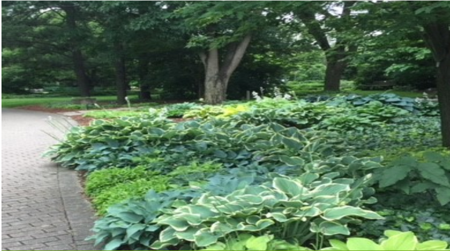
Serving the Green Industry in Central Ohio

Member firms with good news to share are welcome to submit articles and information for the NewScape Express .