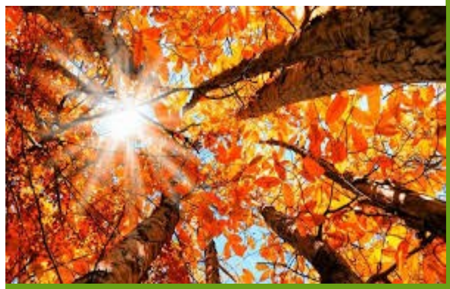
Serving the Green Industry in Central Ohio

Member firms with good news to share are welcome to submit articles and information for the NewScape Express .